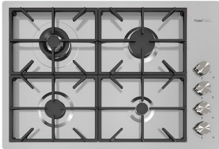
Cooker hob Foster Milano